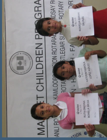
Danli Market Children Program