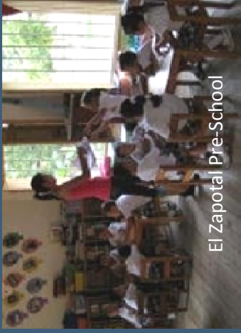
El Zapotal Pre-School